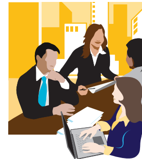
Conduct entrance conference with auditee