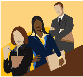
Assignment of audit staff