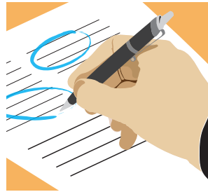
Identify any audit issues