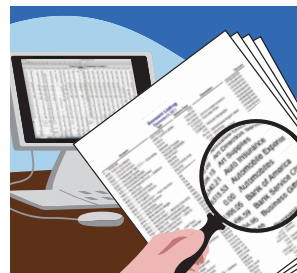
Quality control review