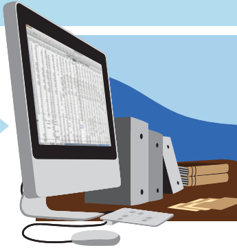
Preliminary research and information gathering