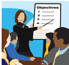
Identify audit objectives and scope