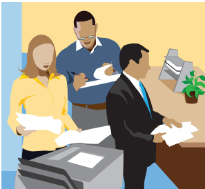
Collect and assess evidence